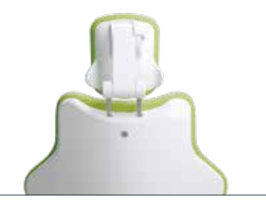
Simply comfortable: the doublejointed headrest can be operated with only one hand and has a rotatable head cushion.