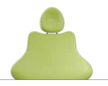
Progress backrest: correct working posture and optimum access for the dentist

According to the individual patient's needs, the flexible rotatable upholstery and the double-jointed headrest allow you to find the right position for your patient to recline perfectly and for you to work effectively.